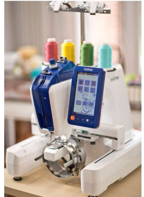
Cap frame shown is an additional purchase.

More creation, less work - the bobbin sensor will tell you when the thread is broken or has run out. While easy access lets you change the lower bobbin without removing your project.