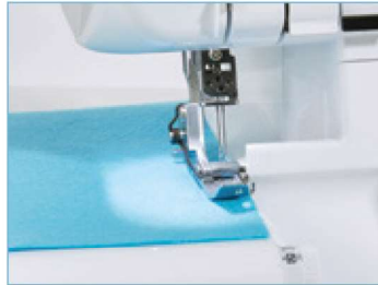
LED work light