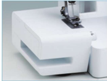
Free arm / Flat bed convertible sewing surface