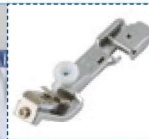
Taping (Elastic) Foot

To attach tapes and elastic to stretch fabrics.