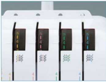
4 colour easy threading guide