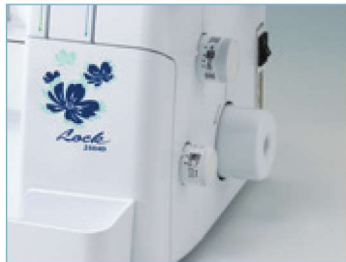
Easy access controls