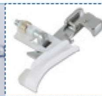
Pearls and Sequins Foot